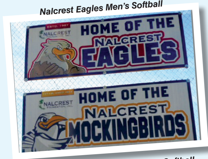
Nalcrest Mockingbirds Women's Softball