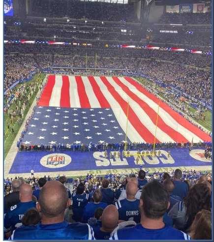
Fort Wayne, IN Branch 116 teamed up with the Indianapolis Colts to raise money

MDA has been involved in research into basic muscle and nerve biology since