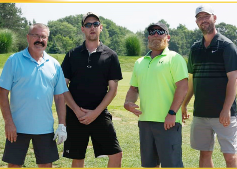
Erie, PA Branch 284's golf tournament