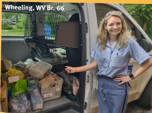
Wheeling, WV Br. 66