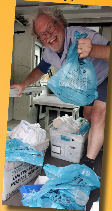
Staunton, VA Br. 513