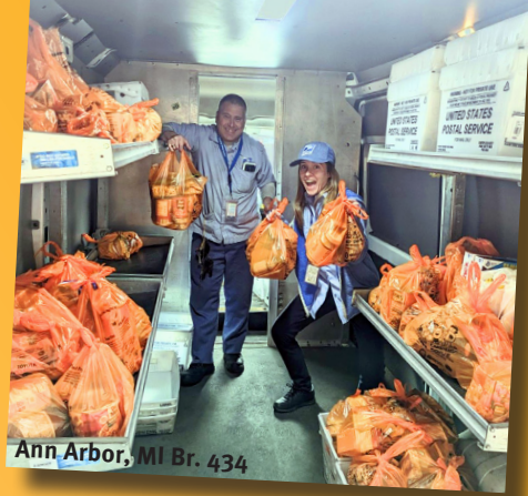
Ann Arbor, MI Br. 434

As in past years, letter carriers in Puerto Rico put in an extra effort to collect both food and cash donations, supporting the effort with a large ad campaign. Working with the United Way, which sponsors the ads that run heavily on five TV stations on the island, San Juan, PR Branch 869 and