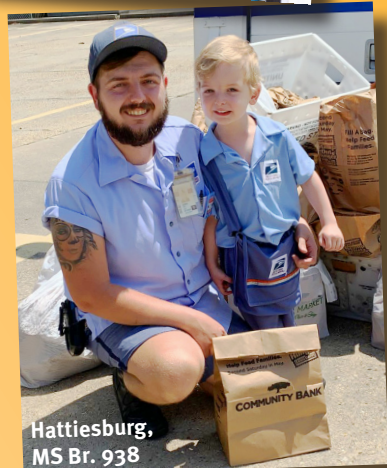
Hattiesburg, MS Br. 938